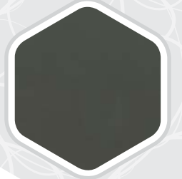
BLACKISH // BASE