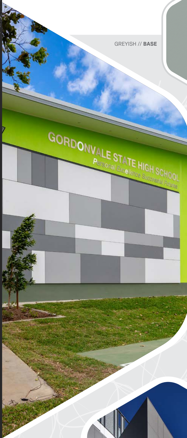
GREYISH // BASE