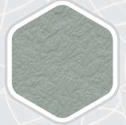
GREYISH // STRING